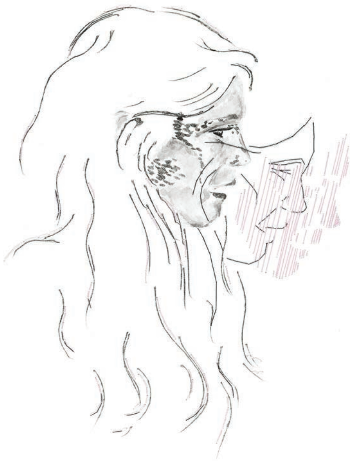
Diana #1 #6 | 2019 watercolor + platinum leaf + thread hand stitched on paper 31 x 41 cm