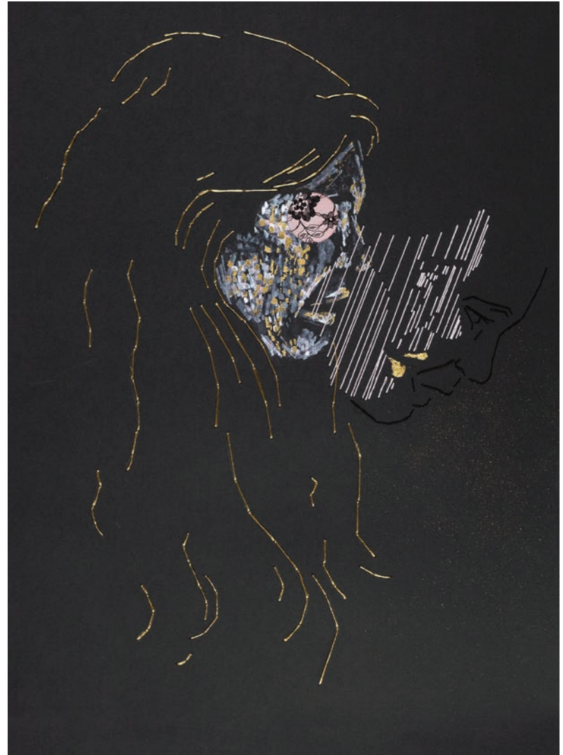
Diana #1 #9 | 2019

watercolor + 24kt gold + lace + thread hand stitched on paper