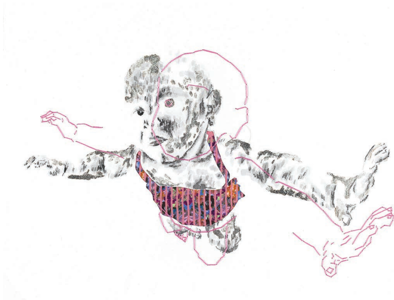
Sapiens II: #2 | 2019

watercolor + silver leaf + textile + thread hand stitched on paper