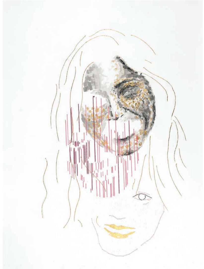
Diana #1 #10 | 2019 watercolor + 24kt gold + thread hand stitched on paper 56 x 76 cm