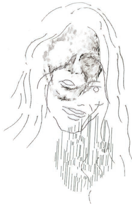
Diana #1 #7 | 2019 watercolor + platinum leaf + thread hand stitched on paper 31 x 41 cm